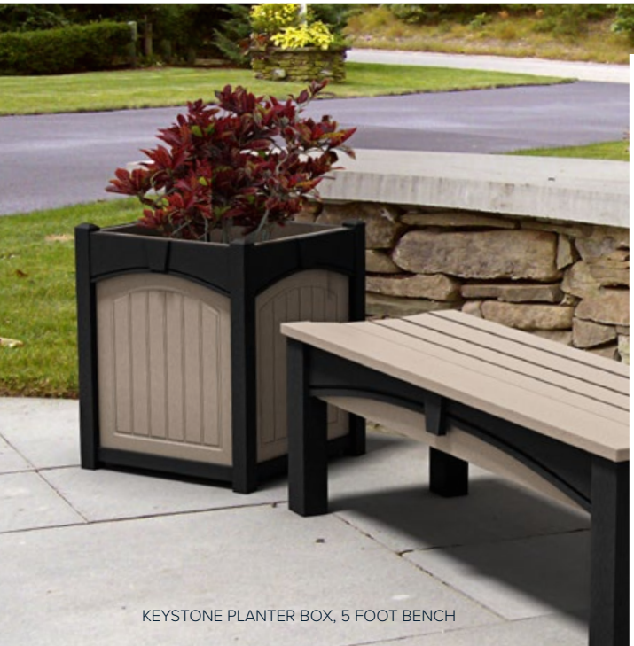
KEYSTONE PLANTER BOX, 5 FOOT BENCH