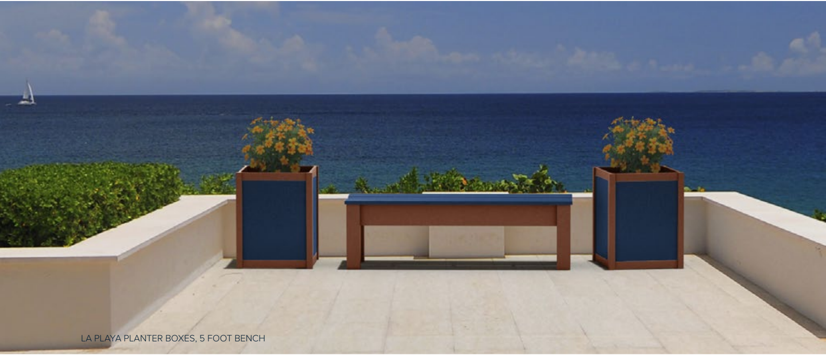
LA PLAYA PLANTER BOXES, 5 FOOT BENCH

Our Planter Boxes can have as much visual impression as the plants you put in them. Coordinate your planter boxes to match your other site furnishings for a complete, coordinated look for your entire property.