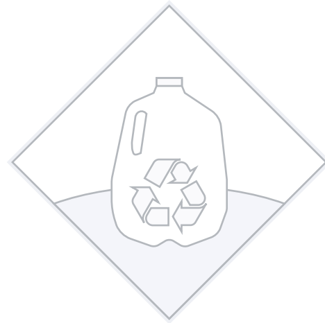
Forever-nu™ Lumber Purest-Grade HDPE Recycled Plastic

For over 25 years, we have worked with some of the best brands in the world, contributing to their sustainability goals. Now we have set the bar even higher by doing our part to help the planet by manufacturing bins made with Forever-nu™ Lumber, diverting plastics from landfills and oceans.