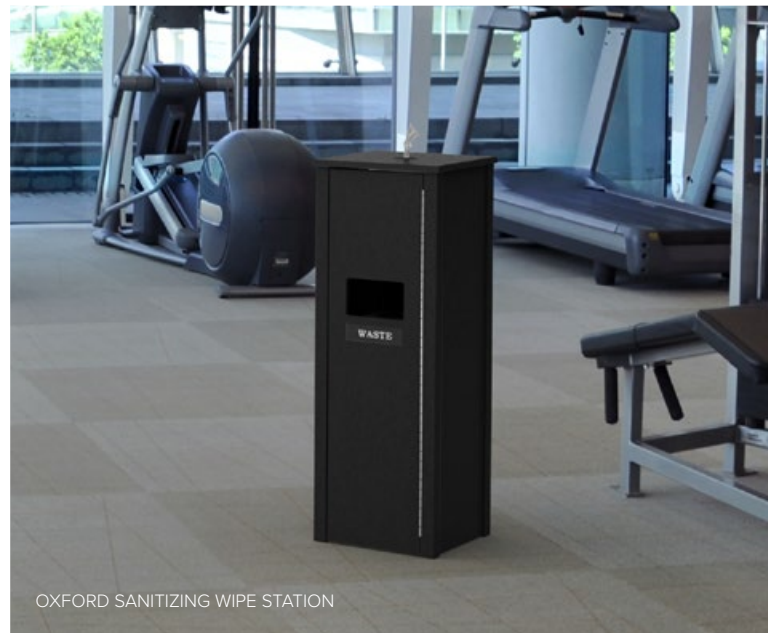
OXFORD SANITIZING WIPE STATION