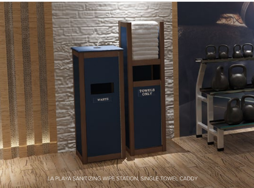
LA PLAYA SANITIZING WIPE STATION, SINGLE TOWEL CADDY