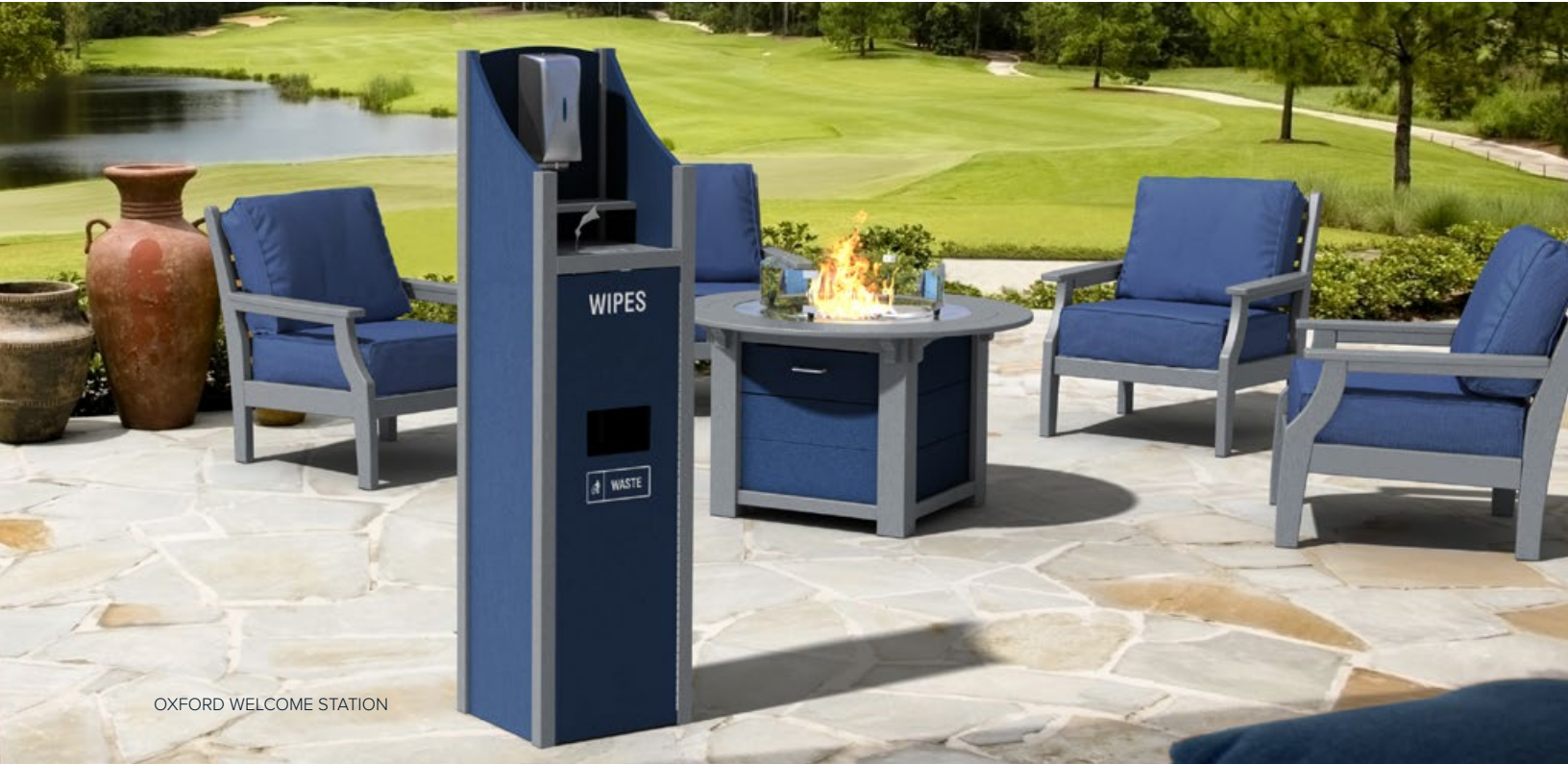
OXFORD WELCOME STATION

The Gym Wipe Station houses sanitary wipes and a 10 gallon waste enclosure in a single footprint and includes a rigid liner (sanitary wipes not included).