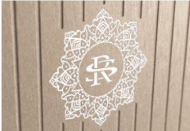
add your logo